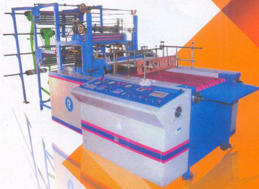
Double Decker Cutting And Sealing Machine With Conveyor System & Controller

HM/HDPE/LDPE/LLDPE/PP/BOPP/Co-Ex & Other Films